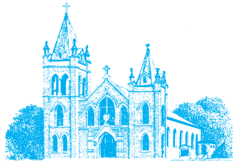
St. Gabriel Archangel

at St. Gabriel's School Hall featuring the Giant Asian Map. The Men's Group will be sponsor- ing a "Burgers and Fries" Supper from 4:30 to 6:30 pm. Free will offering. All are invited to attend.